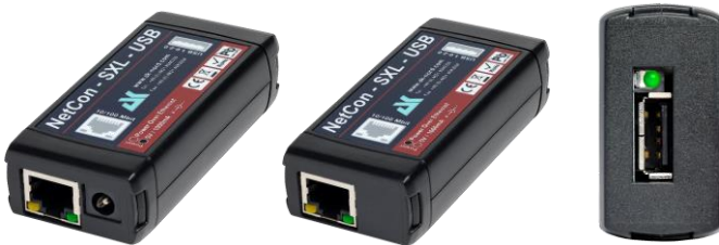
Front with power supply connector