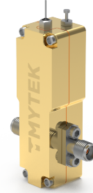
Figure 1. Connectorized Amp Photo