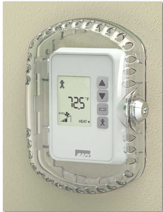
BAPI-Guard 2 Mounted Over a BAPI-Stat “Quantum” Sensor

The BAPI-Guard is made of thick, durable polycarbonate and features exceptional airflow, key lock protection, horizontal or vertical mounting and easy installation with hardware included.